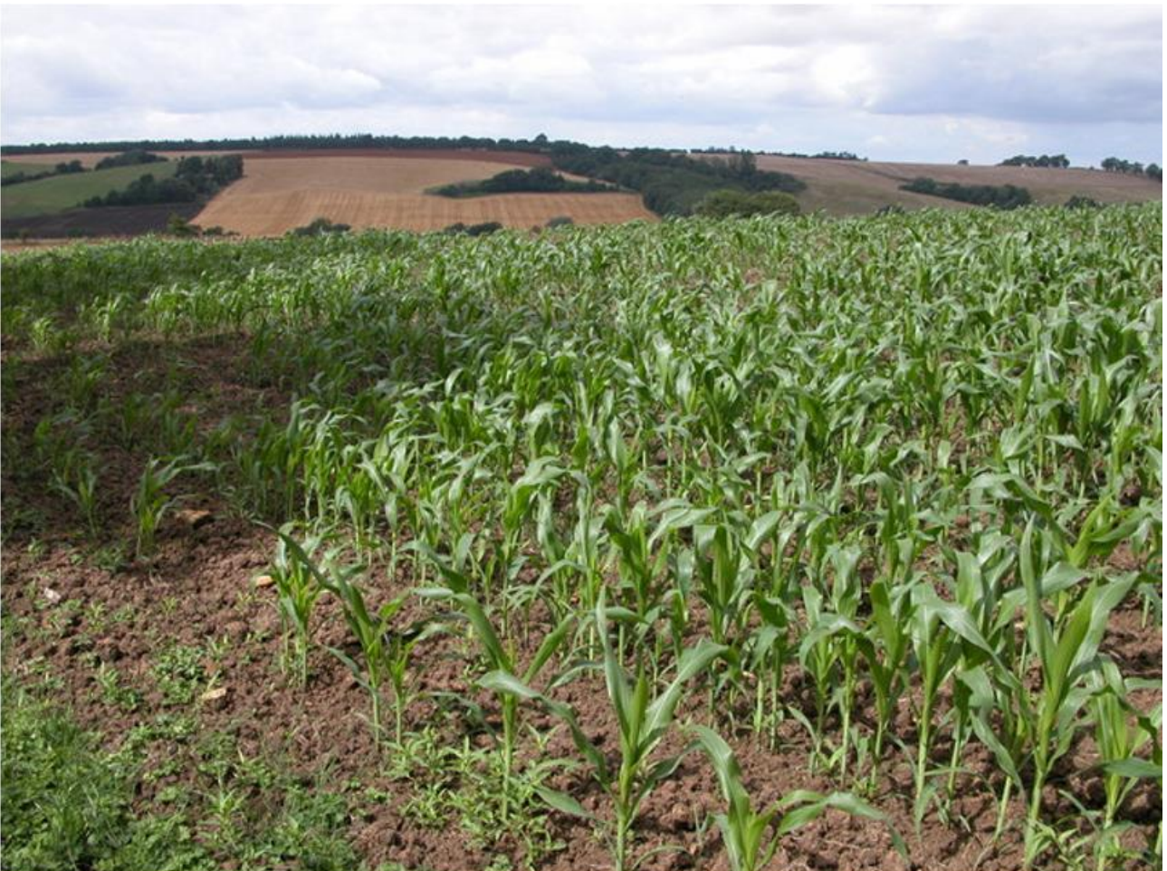
Figure 1. Maize crop near Coombe Farm, Long Compton.