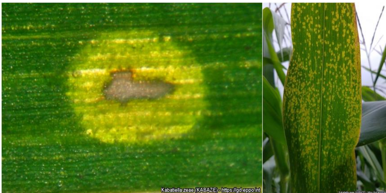
Figure 8. Symptoms of eye spot of maize caused by Kabatiella zae . Early eye spot (left) on maize. Eye spot symptoms spreading (right) on a maize leaf.

The disease is found in many regions globally, in China, India, Japan, Argentina, Brazil and across much of North America and Europe. It has been found in the UK, but reports of economic damage are minimal. This pathogen is likely to have entered the UK on seeds. The full extent of its distribution and damage in the UK is unknown.