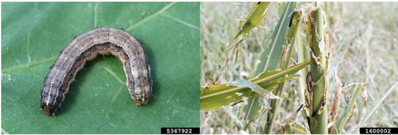
Figure 4. Fall army worm ( Spodoptera frugiperda). Larva (left) of S. frugiperda. S. frugiperda larvae (right) feeding on Zea mays.

This is a notifiable pest so it is important that its presence should be reported to the plant health authorities. Currently the fall army worm is not present in the UK and there have been no findings of the larvae in the wider environment, and no reports of damage. Any findings of this species in the UK would be of significance. If this moth was to establish here, we could expect to see very significant losses not just in maize but also in other crops.