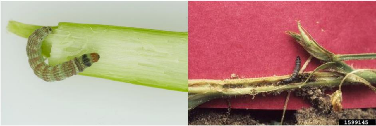
Figure 5. Lesser corn stalk borer ( Elasmopalpus lignosellus ). Larva (left) on asparagus © Fera Science Ltd. Larval tunnel (right) on peanut. © John C. French Sr., Retired, Universities: Auburn, GA, Clemson, and U of MO, Bugwood.org.

The lesser corn stalk borer causes significant crop losses in the US and Central/South America, but it is not well suited to the colder UK climate and is unlikely to cause similar levels of damage here. The lesser cornstalk borer seems to be adapted for hot, arid conditions, and is more abundant and damaging following unusually hot, dry weather in its native range.