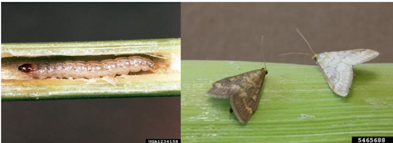
Figure 9. European corn borer ( Ostrinia nubilalis ). Larval tunnel (left) in a stem of maize © Clemson University – USDA Cooperative Extension Slide Series, Bugwood.org. Adult O. nubilalis M left F right © Adam Sisson, Iowa State University, Bugwood.org.

European corn borer ( Ostrinia nubilalis ) is a species of grass moth (Crambidae). It is a polyphagous pest, primarily of grasses, but it is also known to feed on a wide range of other hosts, particularly maize. The non-grass hosts are often ruderal species found in field margins alongside commercial crops. This species has two races: the “E” race, with larvae that preferentially feed on Artemisia species, and the “Z” race, with larvae that preferentially feed on Zea mays . Both races are identical in appearance, but the female moths produce different ratios of pheromones. This moth is native to Europe and occurs across mainland Europe, parts of North Africa and into Asia, where it is reported as far as Indonesia. Reports of O. nubilalis in East Asia probably refer to the closely related species, O. furnacalis (Asian corn borer). The European corn borer has also been introduced into the United States on several occasions and is found right across North America from Texas to Canada. Present in the UK since the 1930’s this species was recorded feeding on Artemisia vulgaris (mugwort). In 2010 a grower in the South-West of England contacted the plant health authorities regarding caterpillars boring into stems of maize ( Zea mays ). The species was confirmed as O. nubilalis and was the first finding of O. nubilalis causing damage to a UK maize crop.