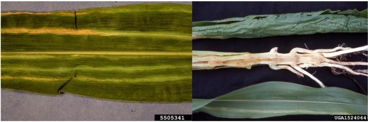
Figure 3. Leaf streak (left) caused by Pantoea stewartii subsp. stewartii. Stalk pith cavities (right) caused by P. stewartii subsp. stewartii.