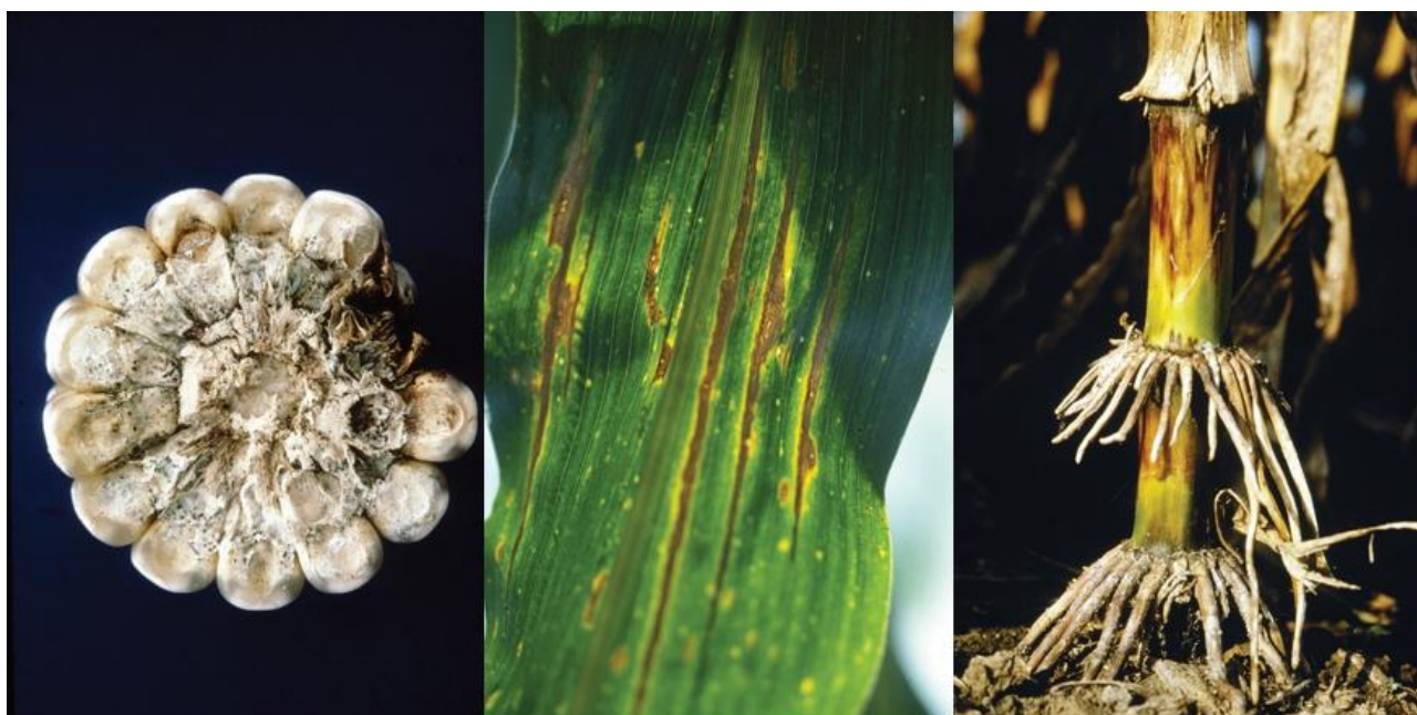
Figure 7. Symptoms of Stenocarpella maydis and Stenocarpella macrospora on maize. Ear rot (left) caused by S. maydis . Leaf stripe (centre) caused by S. maydis on maize. Stalk rot (right) caused by S. macrospora showing browning of the pith.

Both of these diseases can cause rot of the ear and stalks. Ear rot usually begins at the ear base, and can turn the entire ear greyish-brown and shrunken, with white mould found between the grains (Fig. 7). Stalk rot symptoms include 1-10 cm long brown lesions on the stalk and leaves, and wilting, discoloration and drying (Fig. 7). When seed is infected, high levels of pre-emergence death are seen, and seedlings that do emerge develop brown lesions with abnormal root development. Yield losses arise from both poor grain filling and crop loss due to lodging.