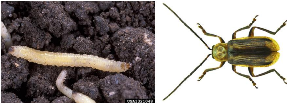
Figure 6. The Western corn rootworm ( Diabrotica virgifera subsp. virgifera ). Larva (left) of D. virgifera © Scott Bauer, USDA Agricultural Research Service, Bugwood.org. Adult (right) of D. virgifera © U. Schmidt.

The pest can be highly damaging. Larvae of the beetle (Fig. 6) feed on the roots, reducing nutrient uptake and growth, and sometimes resulting in lodging during severe infestations. Adults (Fig. 6) feeding on the leaves and silks also cause damage and can interfere with pollination and grain formation. The beetle causes significant crop losses in the US and central/eastern Europe, but the beetle is not well suited to the colder UK climate and is unlikely to cause similar levels of damage here.