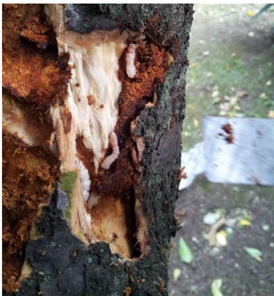
Figure 10. Prunus infested with red-necked longhorn beetle larvae