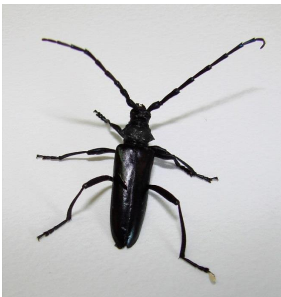
Figure 4. Red-necked longhorn beetle adult with a black pronotum