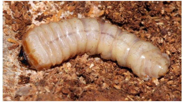
Figure 7. Red-necked longhorn beetle larva