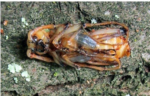
Figure 8. Red-necked longhorn beetle pupa