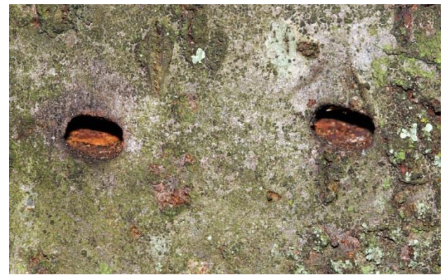
Figure 9. Red-necked longhorn beetle emergence holes