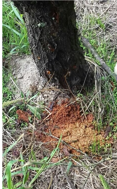
Figure 3. Larval frass of the red-necked longhorn beetle at the base of a Prunus tree in Italy