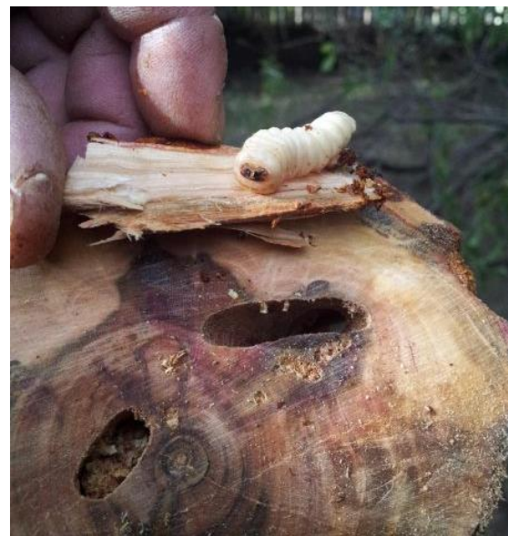
Figure 11. Larva and galleries of the red-necked longhorn beetle