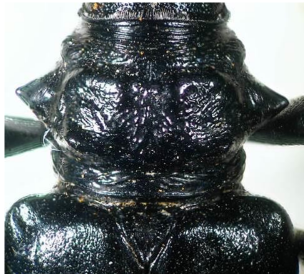
Figure 5. Close-up of a black pronotum