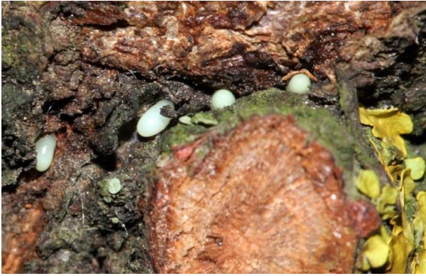
Figure 6. Red-necked longhorn beetle eggs