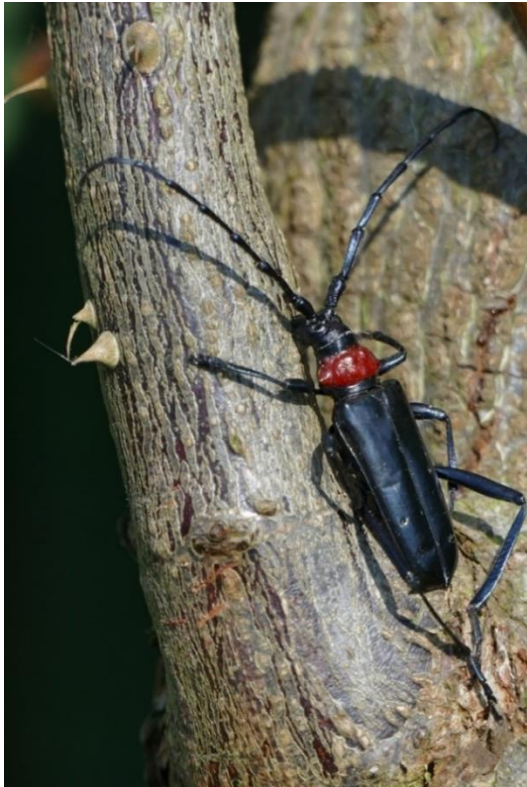
Figure 2. Red-necked longhorn beetle adult with the characteristic red pronotum

uniform metallic green, blue violet, copper or black. In addition, the larvae of A. moschata mainly develop in Salix spp.(willows) and have never been recorded in Prunus spp..