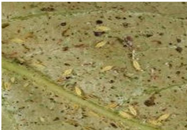
Figure 2. Thrips palmi feeding on the underside of a leaf