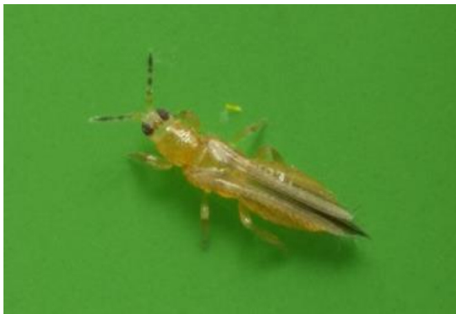
Figure 1. Adult female Thrips palmi © Crown copyright.