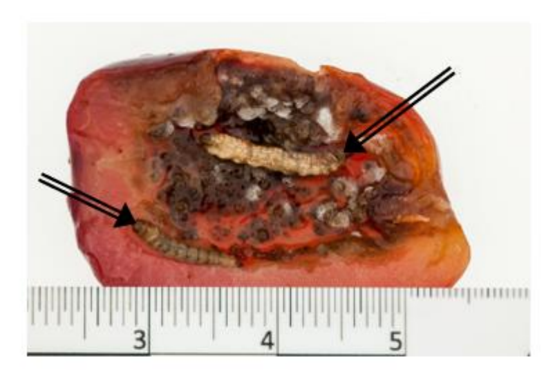
Fig. 1. False codling moth caterpillars (dead, marked with arrows) inside a cut-open grape